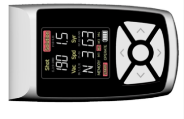
Parameter interface placed on the head of the device.

1. Shot : The function is used to define the number of shots to be made for the defined quantity of solution. The quantity can be changed gradually up to 200 shots. A «C» mode is the continuous mode that allows continuous injection by holding the trigger down. 2. Solution : The function is used to define the amount of solution inside the syringe. With the button, each click increases or decreases by 0.5 on a scale from 0 to 3.0. 3. Speed : The injection speed is strongly related to the pain. The function makes it possible to set the injection speed from 1 to 5 (1 represents a slow speed and a faster injection time). Generally, a fast injection time causes more pain for the patient. 4. Suction : The function allows you to set the suction power from 1 to 3. A higher number means a higher suction power. An «N» mode (non-aspiration mode) can be used with the 5pin multi needle for scalp treatment. 5. Syringe : The function allows you to set the syringe size used. 6. Memory : The memory function allows you to save from M1 to M4 settings that you will use regularly.